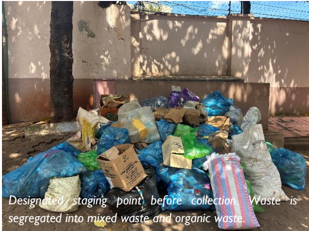
Designated staging point before collection. Waste is segregated into mixed waste and organic waste.

typically results in cleaner surroundings and more controlled waste handling.