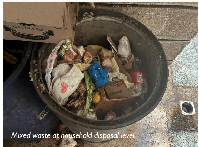
Mixed waste at household disposal level.

"The challenge is when waste is mixed. Plastic or other contents can harm the animals."