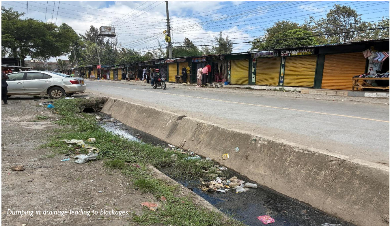
Dumping in drainage leading to blockages.

Interest in participating in a structured pilot was expressed across multiple business interviews. However, this willingness was consistently conditional on how such a system would be implemented, particularly whether separation at source could be integrated into existing operations without adding complexity.