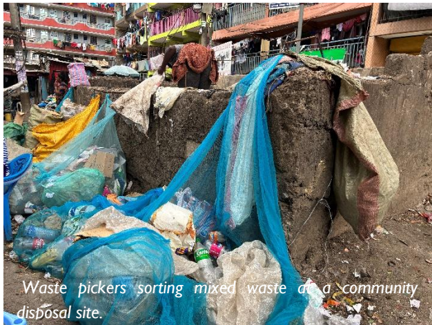
Waste pickers sorting mixed waste at a community disposal site.

Working conditions involve exposure to hazardous materials, lack of protective equipment, and the risk of material loss due to site clearing or burning. Workers at one pit also identified e-waste as an active gap; electronic components accumulate at the site without a reliable buyer. This is a potential recovery opportunity.