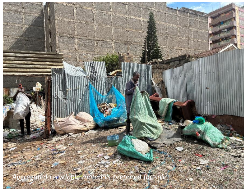
Aggregated recyclable materials prepared for sale

"Transport is a challenge. If I had my own, I could collect from much further."