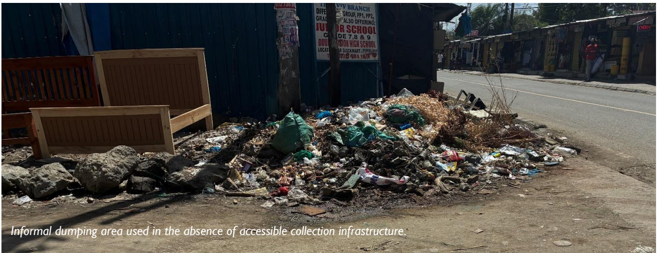
Informal dumping area used in the absence of accessible collection infrastructure.

Material recovery is taking place across multiple points in the system. Informal collectors recover recyclables from households, streets, and disposal points, while aggregators consolidate and channel materials into recycling markets. These activities contribute significantly to reducing waste volumes and enabling resource recovery. However, they operate largely outside formal systems and are not coordinated with collection services. This creates inefficiencies in material flow, with recovery depending on access, timing, and individual effort rather than structured processes.