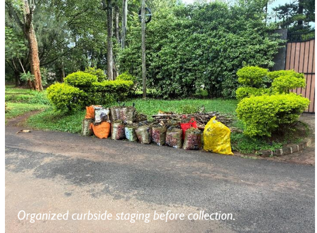
Organized curbside staging before collection.

commonly between organic and mixed waste, and may provide extra collection bags to support this process. In these cases, participation is often high and systems tend to function effectively. In other estates, waste is still collected as mixed, with no requirement or support for separation.